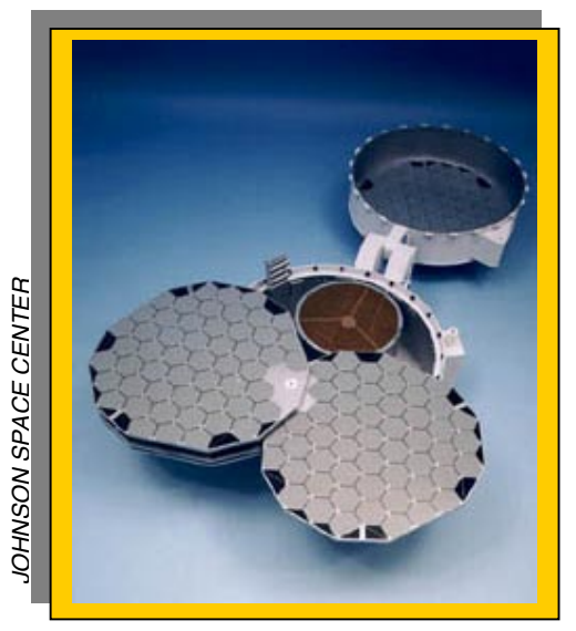
Genesis mission collector arrays and concentrator.

Technology Applications are available for this module.