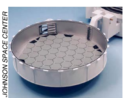
Genesis mission solar wind collector (2001).