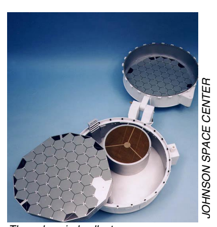
The solar wind collector arrays and concentrator.

After two years of collecting solar wind particles, the sample return capsule (SRC), which contains the canister containing the collector wafers and concentrator, will be captured in mid-air with a helicopter. In the event that the helicopter is not able to do this, the SRC will impact the ground. Genesis scientists have tested this impact and have designed the SRC to minimize wafer breakage. Students work in Product Design Teams to complete a design of collector wafers that will withstand an impact. A drop test will be performed and design changes made.